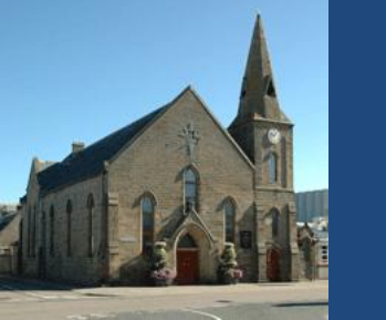
why not come and lead us?